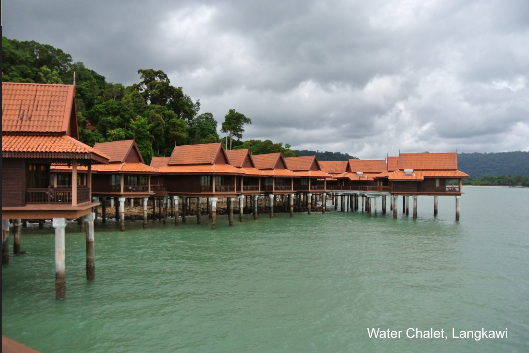
Water Chalet, Langkawi