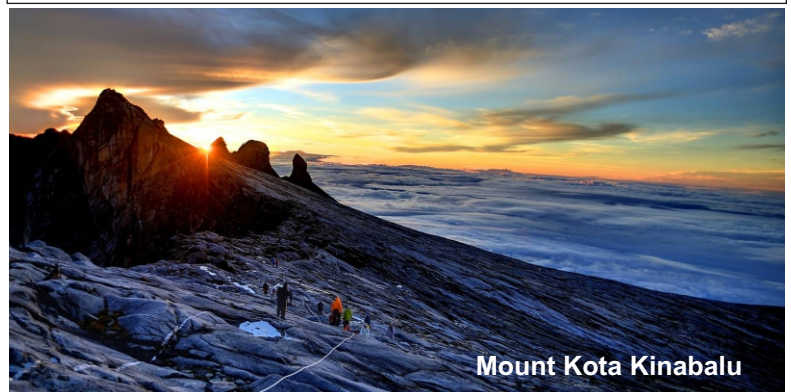
Mount Kota Kinabalu