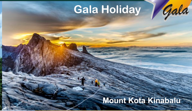
Mount Kota Kinabalu