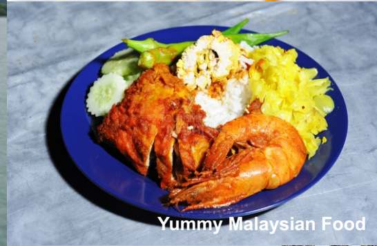
Yummy Malaysian Food